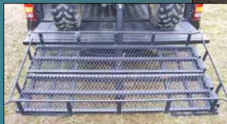
Ramps convert to cargo carrier.

Rack-n-Ramp with Slack-n-Ator ..... LGD-RCK-RMP