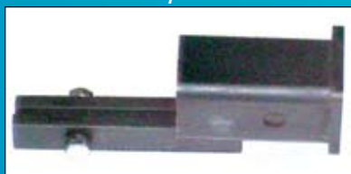
ATV Receiver Adapter

ATV 2" Ball Mount with Slack-n-Ator ..... ATV-BM2 ATV 1 1/4" Ball Mount with Slack-n-Ator ..... ATV-BM125 ATV 1 1/4" to 2" Receiver Adapter with Slack-n-Ator ..... ATV-CV