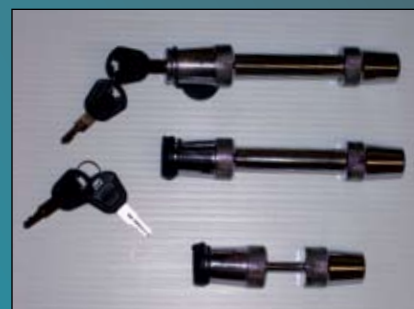
3-Piece Lock Set

3-Piece Set: 2 pin locks, 1 hitch lock.....CL-3