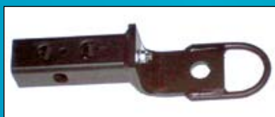
ATV 2" Ball Mount

Tow Bar Ball Mount with Slack-n-Ator, 2" Drop, 3/4" Rise ..... SLK-2 Tow Bar Ball Mount with Slack-n-Ator, 3" Drop, 1 3/4" Rise ..... SLK-3 Tow Bar Ball Mount with Slack-n-Ator, 5" Drop, 3 3/4" Rise ..... SLK-5 Tow Bar Ball Mount with Slack-n-Ator, 7" Drop, 5 3/4" Rise ..... SLK-7 Tow Bar Ball Mount with Slack-n-Ator, 10" Drop, 9" Rise ..... SLK-10