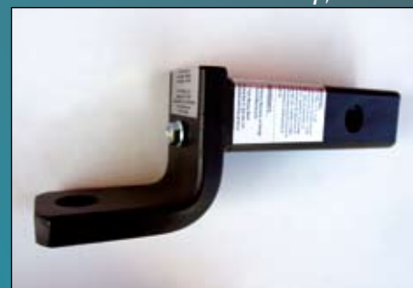
Tow Bar Ball Mount with 3" Drop, 1 1/4" Rise

Tow Bar Ball Mount with Slack-n-Ator, 2" Drop, 3/4" Rise ..... SLK-2 Tow Bar Ball Mount with Slack-n-Ator, 3" Drop, 1 3/4" Rise ..... SLK-3 Tow Bar Ball Mount with Slack-n-Ator, 5" Drop, 3 3/4" Rise ..... SLK-5 Tow Bar Ball Mount with Slack-n-Ator, 7" Drop, 5 3/4" Rise ..... SLK-7 Tow Bar Ball Mount with Slack-n-Ator, 10" Drop, 9" Rise ..... SLK-10