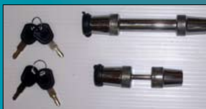
2-Piece Lock Set